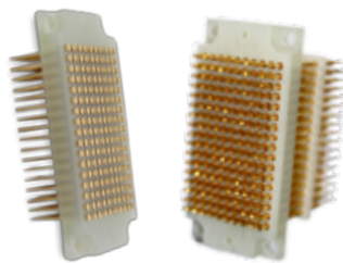
170 Pole Pylon Block